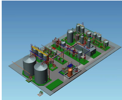
Use MPDS4 to easily export complete plants or factories for users of MPDS4 REVIEW

MPDS4 REVIEW provides exceptional flexibility in its licensing concept, allowing others to borrow a license by checking it out for a designated time period for independent use (temporary connection to your license server is required for check-out). This means that you can use the same license at different times on or off site without incurring extra costs, providing it to colleagues, project managers or customers.